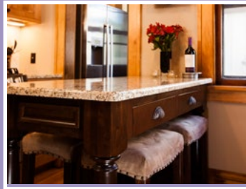
Right: A new and improved layout