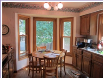
Right: Original peninsula