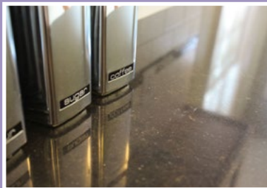
Center: Detail of countertops