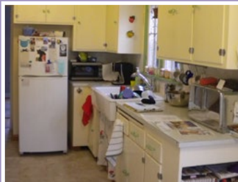
Left: Original cabinetry