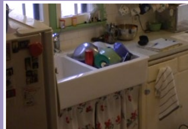
Right: Original farmhouse sink and undersink storage

Are you ready to get your remodeling project started? Call us today and mention House H22! 612-789-8509