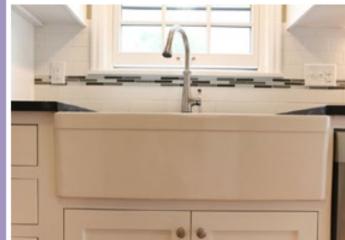
Right: Detail of farmhouse sink